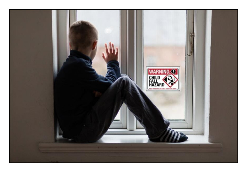
PPV Partners and MHOs across the nation are working towards installing window safety measures to ensure a safer environment for our Marines, Sailors, and their families